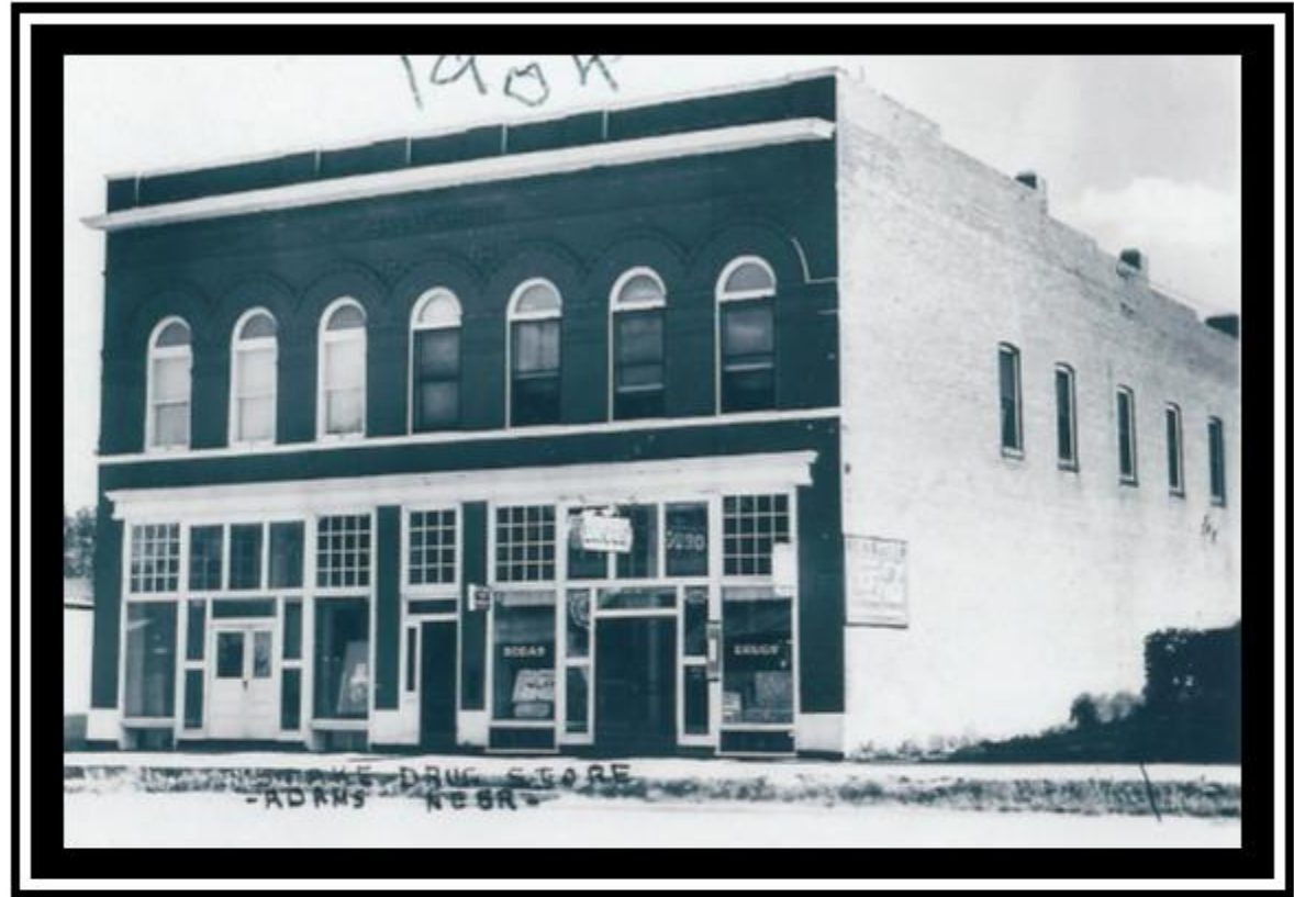
McKibbin building above built in 1904. Was later Stake Drug.