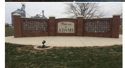
The top photo is from the collection of Dan Harms and is a birds eye view of Adams around 1909. The second photo of the Adams Welcome sign was taken by Bev Buss in 2017. The sign was sponsored by the Adams Community Foundation.